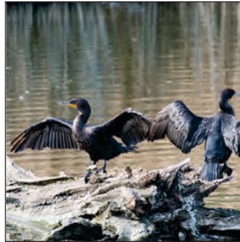
Double-crested cormorants