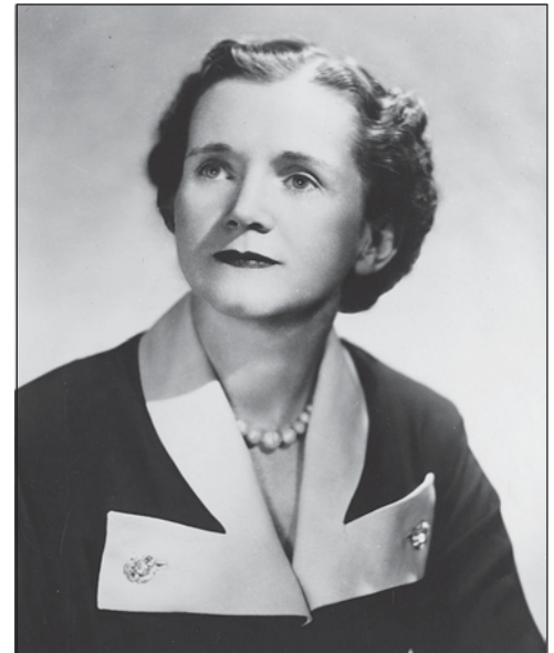
Biologist Rachel Louis Carson.