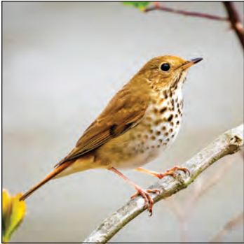
Hermit thrush

Can you find all these birds on the pages of the book? Rachel started her love of nature by watching birds. The title of her most famous book, Silent Spring , refers to the lack of bird songs if many birds die of the chemical DDT and other pollution. Do any of these birds live in your neighborhood? Conduct research in books, magazines, or the Cornell Lab of Ornithology website ( https://www.allaboutbirds.org/guide/ ) to find out more about these birds: What habitat do they need? What do they eat? Do they migrate? Why they are important in the environment?