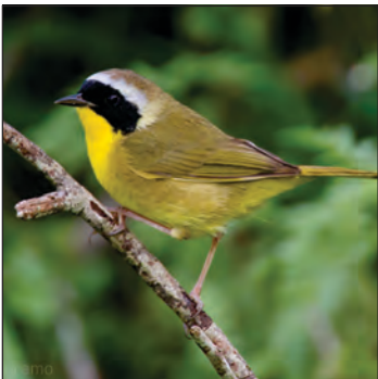
Common yellowthroat