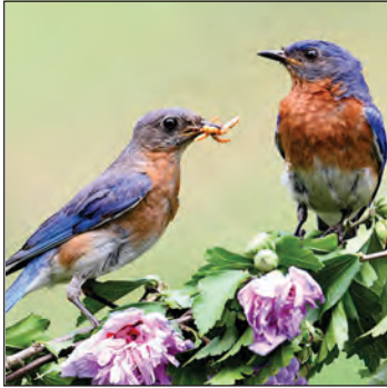
Eastern bluebirds