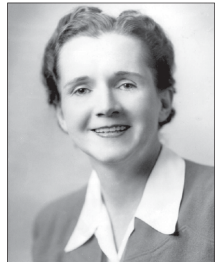
Rachel Carson, U.S. Fish and Wildlife Service Headquarters.