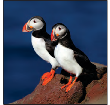
Atlantic puffins