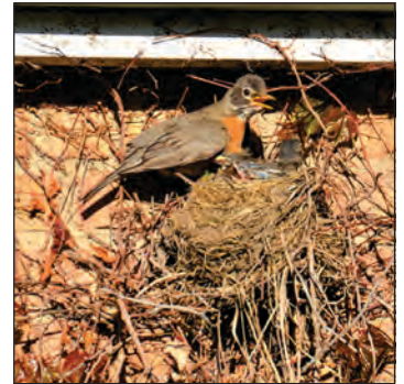
American robin