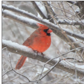
Northern cardinal