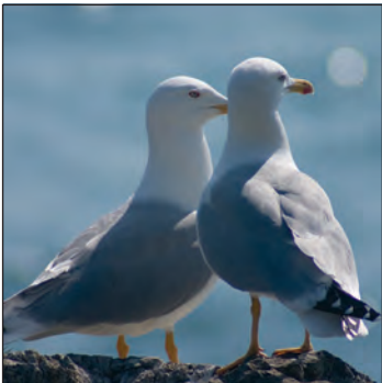
Yellow-legged gulls